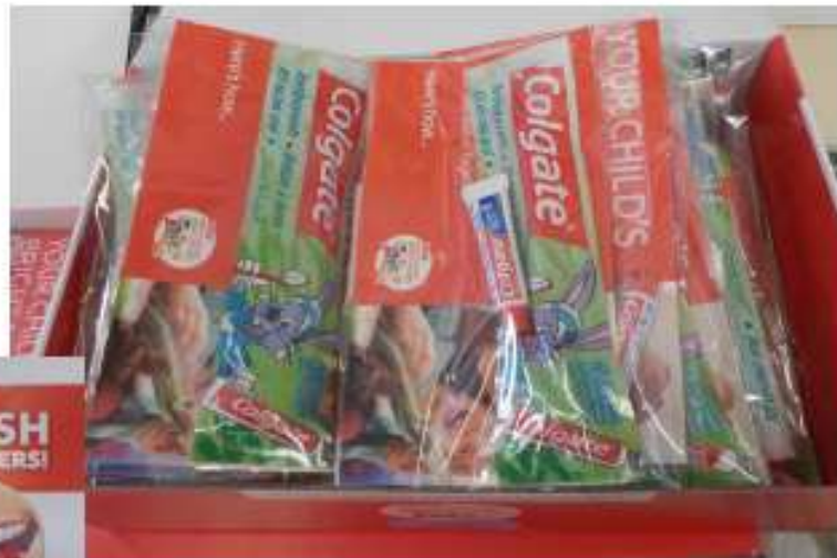
The free kits from Colgate

We have done a mini unit on the Royal Adelaide Show in Room 2. We looked at mapping, timetables and financial planning. We also looked at show bags and their origins as sample bags. We designed our own sample bag for teeth. We worked with Room 1 and used a kit supplied from Colgate for resources.